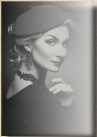
The Sculptor: Crafts theft-resistant items and clones to extend item pools and thwart cheaters.