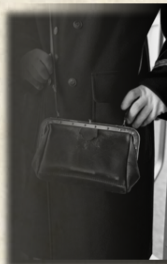
The Conductor: Manages the test security program and communicates the importance of test security-awareness.