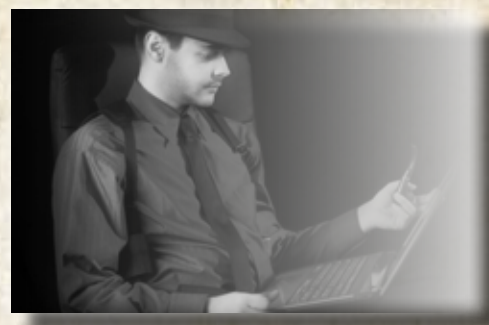
The Surfer: Finds and removes stolen test content from the web and social media sites.