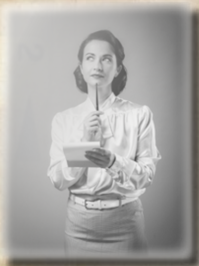
The Architect: Set goals and thinks through test security strategies.