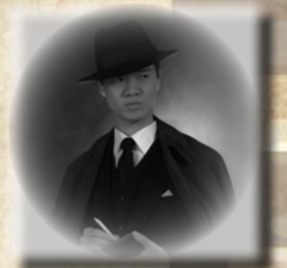
The Patrol Officer: Keeps a watchful eye over the physical environment of a testing organization.