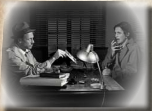
The Prosecutor: Investigates test security breaches to determine who is responsible.