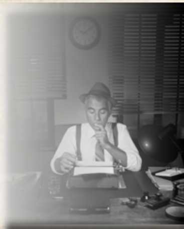
The Reporter: Monitors secure test administrations, keeping a keen eye out for peculiar test taking behaviors.