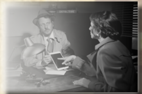
The Techie: Ensures the right levels of computer and system access are administered and monitored.