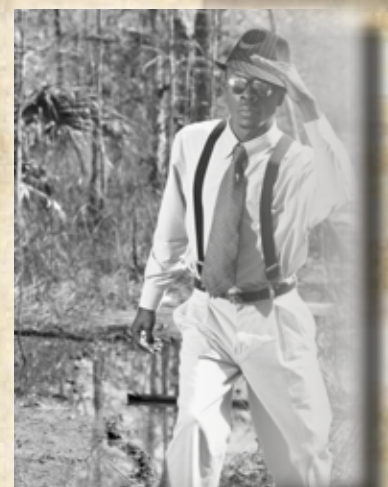
The Oracle: Anticipates testing maleficence by creating and managing a security incidence response plan.